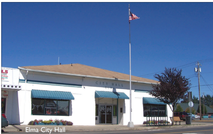
Elma City Hall

Applications require extensive preparation time, and include a public hearing requirement and other reporting requirements. Please plan ahead! For more information, review the state Department of Commerce website for this program, at www.commerce.wa.gov/cdbg or call the COG office at 360-537-4386.