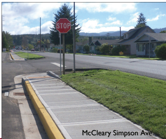
McCleary Simpson Ave.