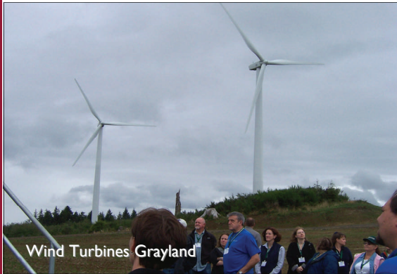
Wind Turbines Grayland